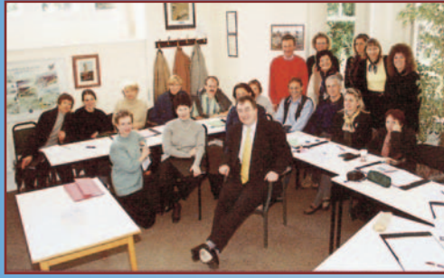
Swiss Teachers meet the Torbay MP